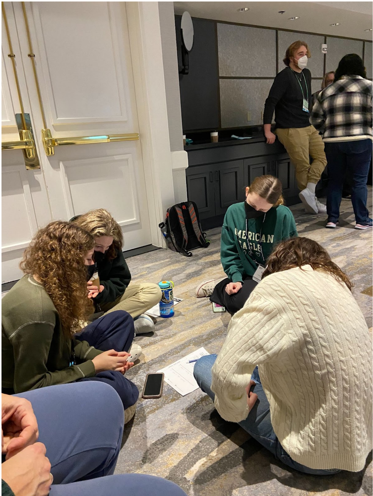
The Group Working on Their Proposals