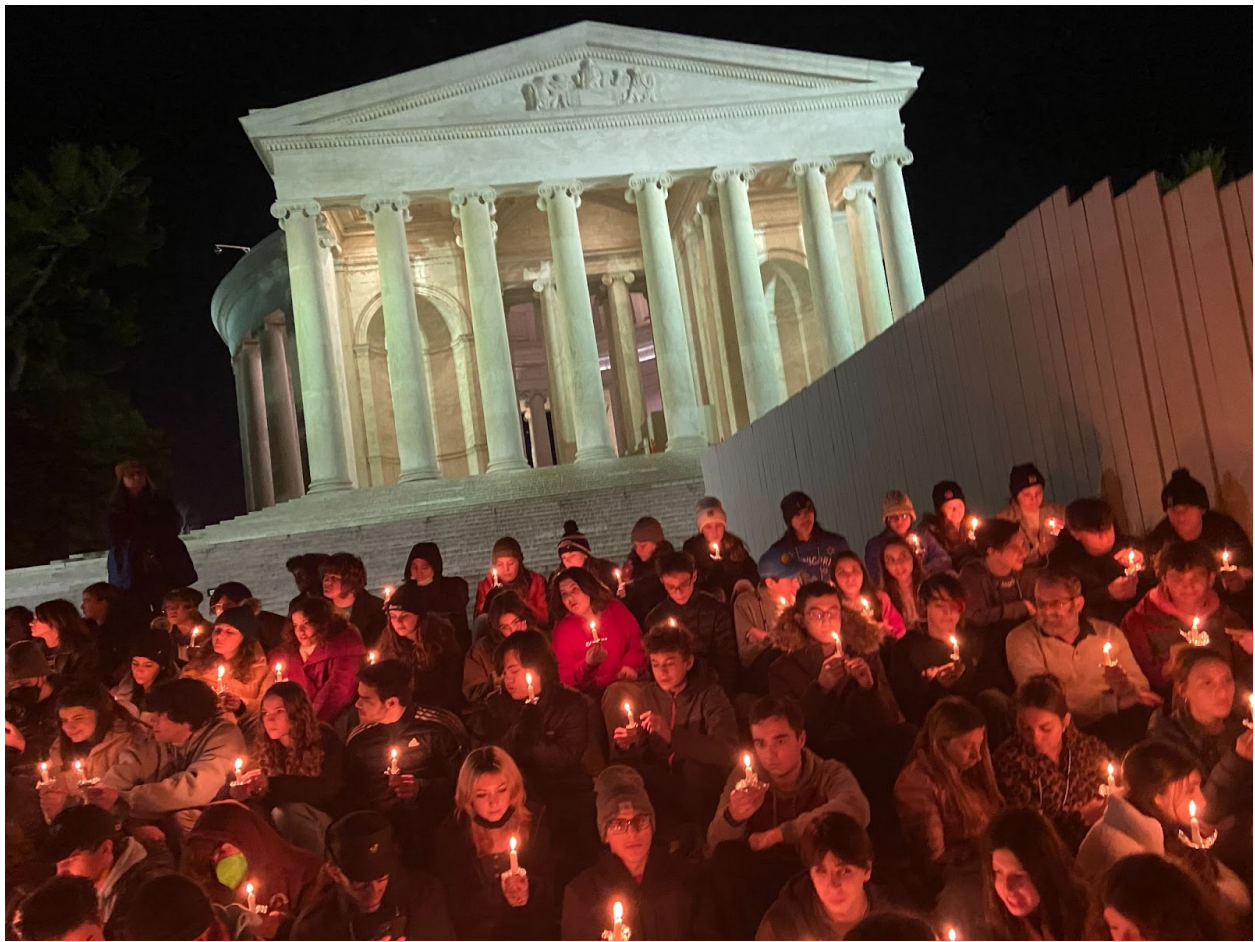
Havdalah in front of Jefferson Memorial