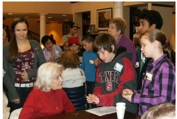
Beit Sefer students entertained residents of Emeritus assisted living with Hanukkah songs and dreidel games.